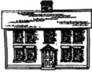
John Hunt House

East Providence Historical Society P.O. Box 4774 East Providence, RI 02916