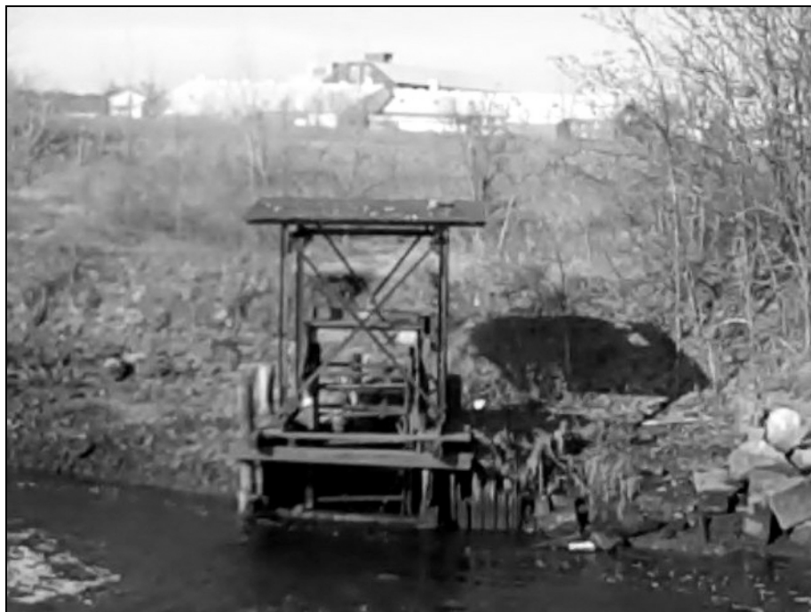
The old pump at Omega Dam.