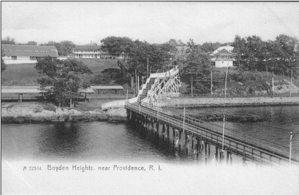
An early postcard view of what is now part of the East Bay Bike Path