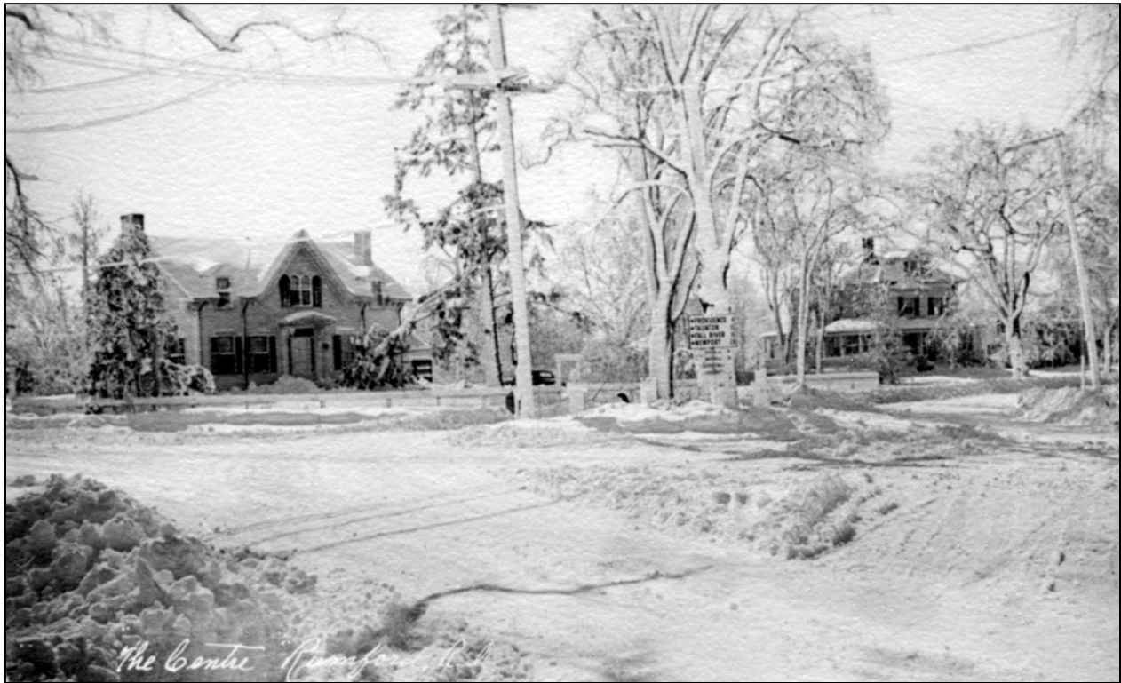
The Center Rumford, R.I.

Postcard