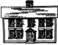
John Hunt House

East Providence Historical Society P.O. Box 4774 East Providence, RI 02916