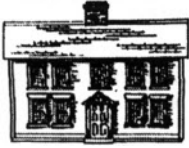
John Hunt House

East Providence Historical Society P.O. Box 4774 East Providence, RI 02916