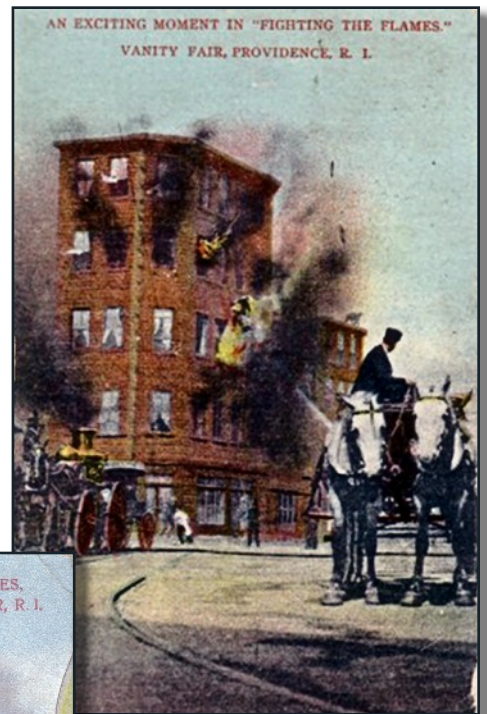
Postcard views

This was a mockup of a city block complete with the Vanity Fair fire department. Inside the tall building gas jets were strategically placed to safely create the illusion of flames leaping out of some windows.