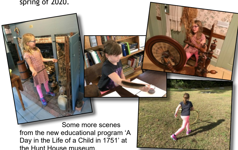
Some more scenes from the new educational program 'A Day in the Life of a Child in 1751' at the Hunt House museum.

Over the summer and fall the Committee has been refining the program which is now called 'A Day in the Life of a Child in 1751', which is the year the John Hunt House Museum was built. The goal is to have local 3 rd and 4 th graders experience the way life might have been for a child in 1751. We are in the process of contacting teachers so that they will know about the program and perhaps be willing to book a date to bring a class in the spring of 2020.