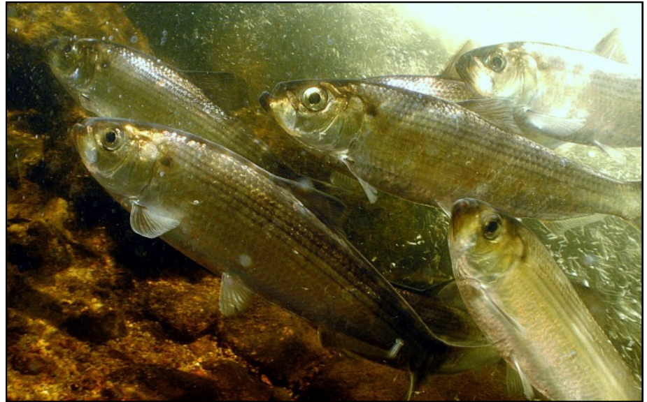
River herring are an important food source for ospreys, bluefish and striped bass.

Spring flows on the Ten Mile River have to be just right for river herring to get by a natural obstruction at Hunt's Mills. At high water, fish are pushed back; at low flows, a 3-foot bedrock ledge is exposed—too tall for the herring to swim over. The addition of stone or concrete weirs would create a series of pools to calm the river and submerge the outcrop, allowing fish to ascend a watery staircase. But the river's rocky and irregular bottom is difficult to replicate in a computer model. And we want to get the design right before pouring concrete.