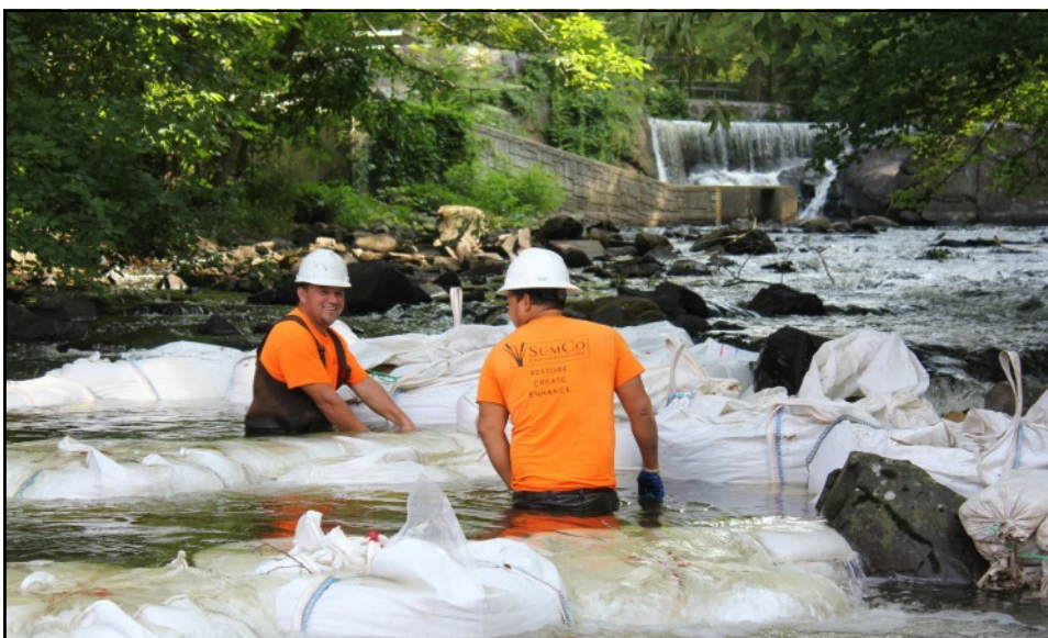
SumCo Eco-Contracting created 4 staging pools for herring below the Hunt's Mills ladder.

The USFWS Fish Passage Engineering Group is working with TNC and RIDEM to improve fish passage on the Ten Mile, Pawcatuck and Blackstone Rivers, under a contract with TNC's RI Chapter. The project at Hunt's Mills cost $53,000 and will enhance a $7.7 million investment in the Ten Mile River, led by the US Army Corps of Engineers, RIDEM, the City of East Providence and Save The Bay. It follows TNC's conservation of the Agawam-Hunt Club, just downriver.