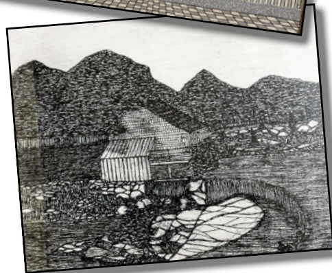
Some examples of Len Iannacone's art