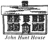
John Hunt House

East • Providence • Historical • Society P.O. Box 4774 East Providence, RI 02916