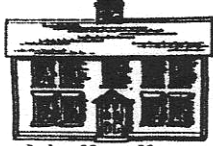
John Hunt House