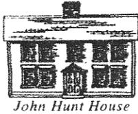
John Hunt House

East • Providence • Historical • Society P.O. Box 4774 East Providence, RI 02916