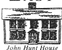
John Hunt House