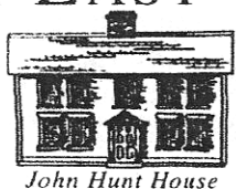
John Hunt House