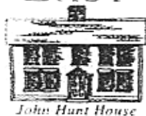
John Hunt House