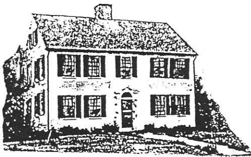
John Hunt House