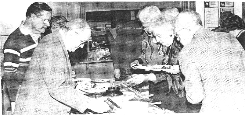
Potluckers Examining the Tasty Array

I hope to see all of you at the Library Memories Roundtable on February 28 at Weaver. And dont forget to reserve your tickets for the Pasta Supper on March 12 at Newman Church.