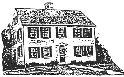
John Hunt House