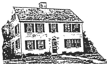
John Hunt House