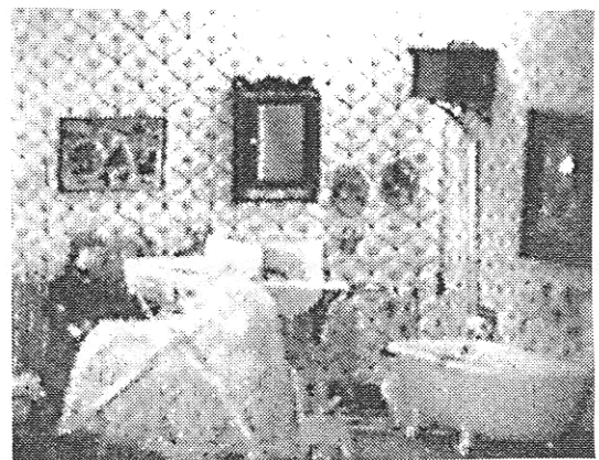
Bathroom of Plummer Doll House