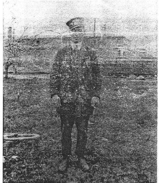
Trolley car conductor with old Riverside trolley barn in background.

Admission is by Ticket Only! Tickets may be reserved and picked up at the 'door' by calling 438-1750 or 437-1530. The deadline for reservations is Saturday, June 21 st .