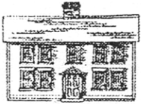
John Hunt House