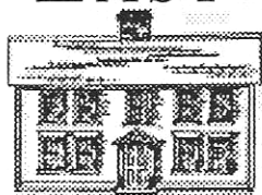
John Hunt House