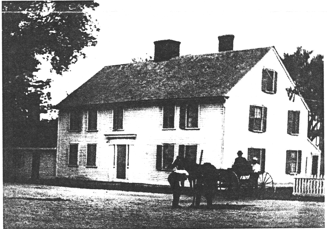
Bishop's Tavern which once stood at the curve at East Providence/Rumford Center on Route 1A.