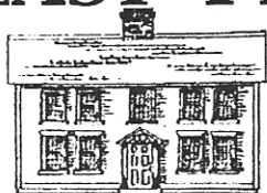
JOHN HUNT HOUSE