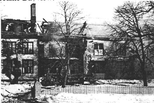
St. Mary's Bayview at height of fire.

The building was totally destroyed. The disaster was now realized and help came from all directions. The East Providence School Dept. offered any school for temporary placement of the students. On the afternoon of February 12, and every afternoon until graduation or the remainder of the school year, Brightidge School with its little chairs and desks became Bayview.