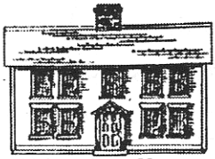
John Hunt House