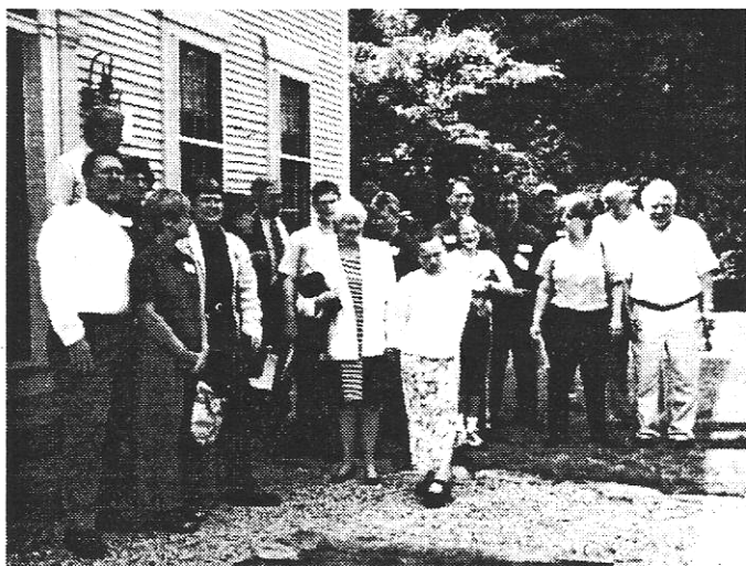
Walker descendents gather for family photo.