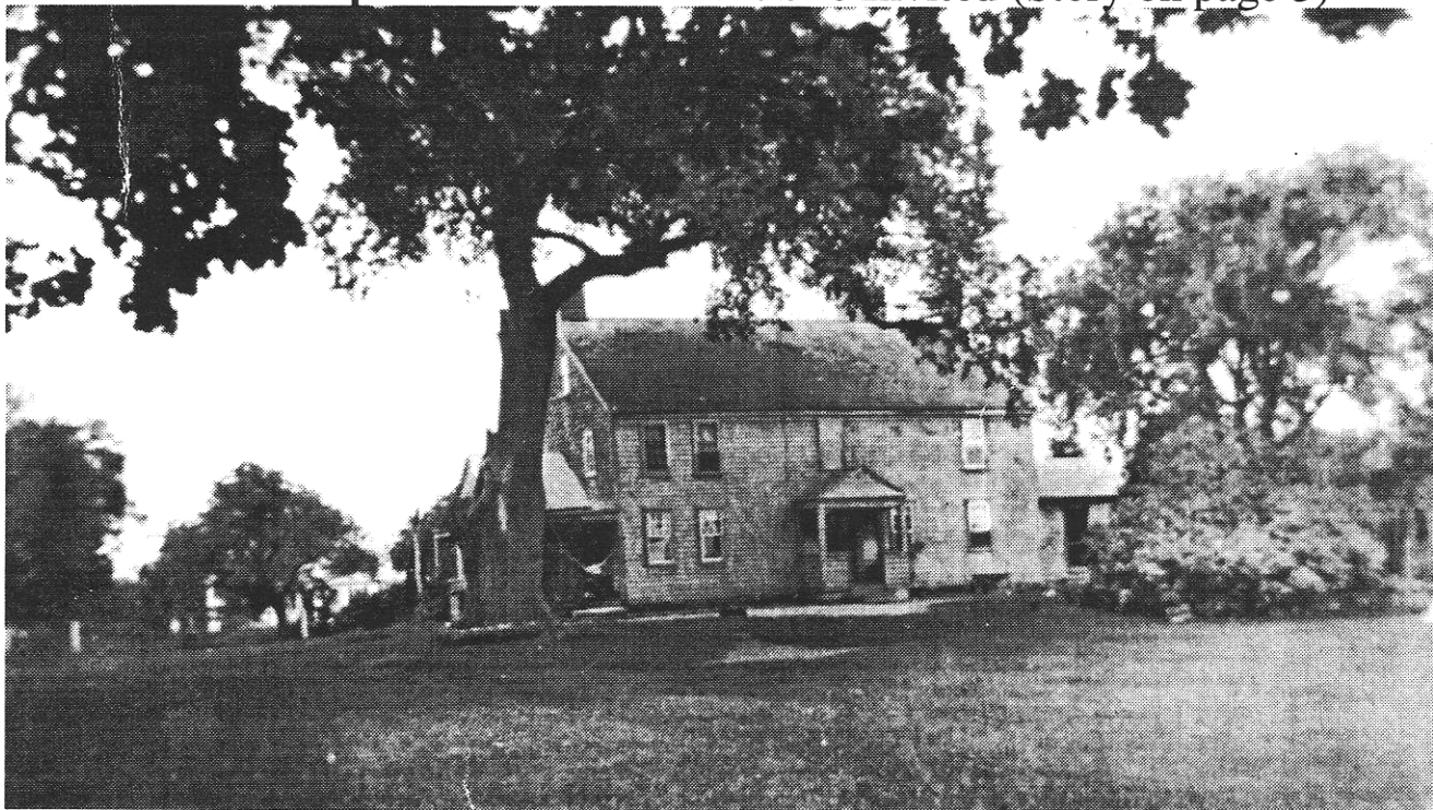
Philip Walker House as it looked in 1900 - 1910