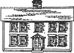
John Hunt House