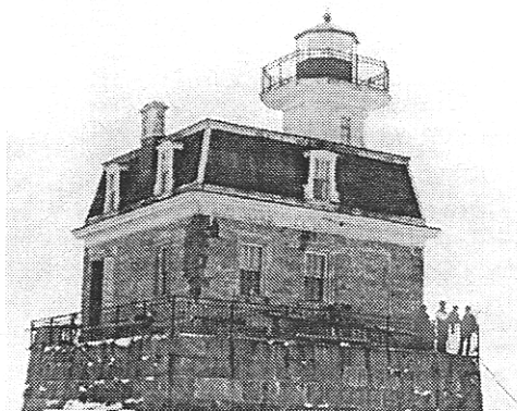
Sabin Point Lighthouse

The display includes models and pictures of Rhode Island lighthouses from the collection of Dave Kelleher.