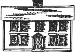
John Hunt House