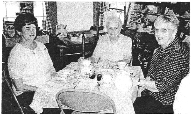
Photos from the Colonial Tea

Sunday, July 10, 1 - 4 p.m. Hunt House Museum Hunts Mills Road, Rumford Admission $3; $1 E.P. residents Free society members