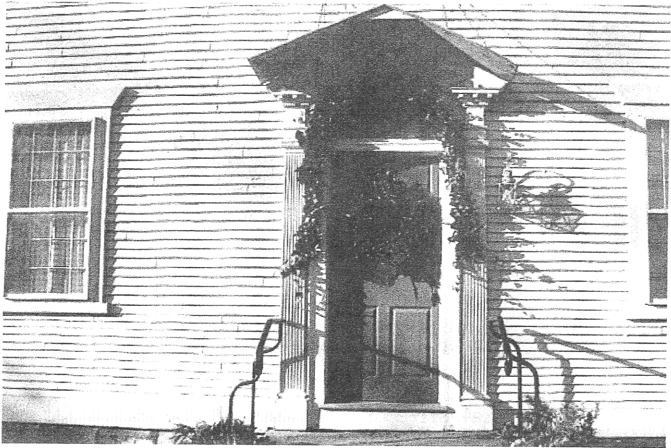
More Holiday pictures from the Hunt House