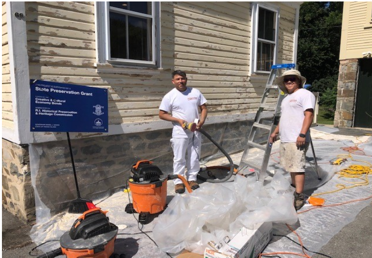
Left: Levine Painters preparing the Education Center for repainting.