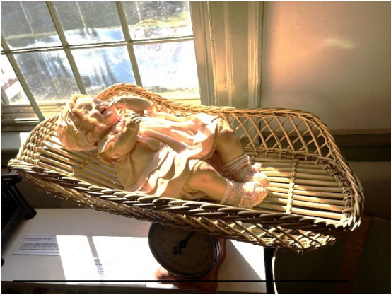
Baby doll above...“Bits and Pieces” below