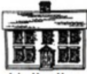
John Hunt House

East Providence Historical Society P.O. Box 4774 East Providence, RI 02916